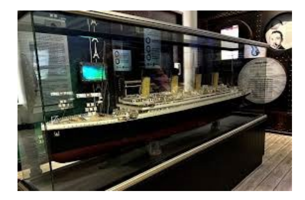
The titanic exhibition at Cobh Heritage Centre

At the Cobh Heritage Centre the participants learned about the Irish emigrant experience via the centre's award-winning story-led exhibition.