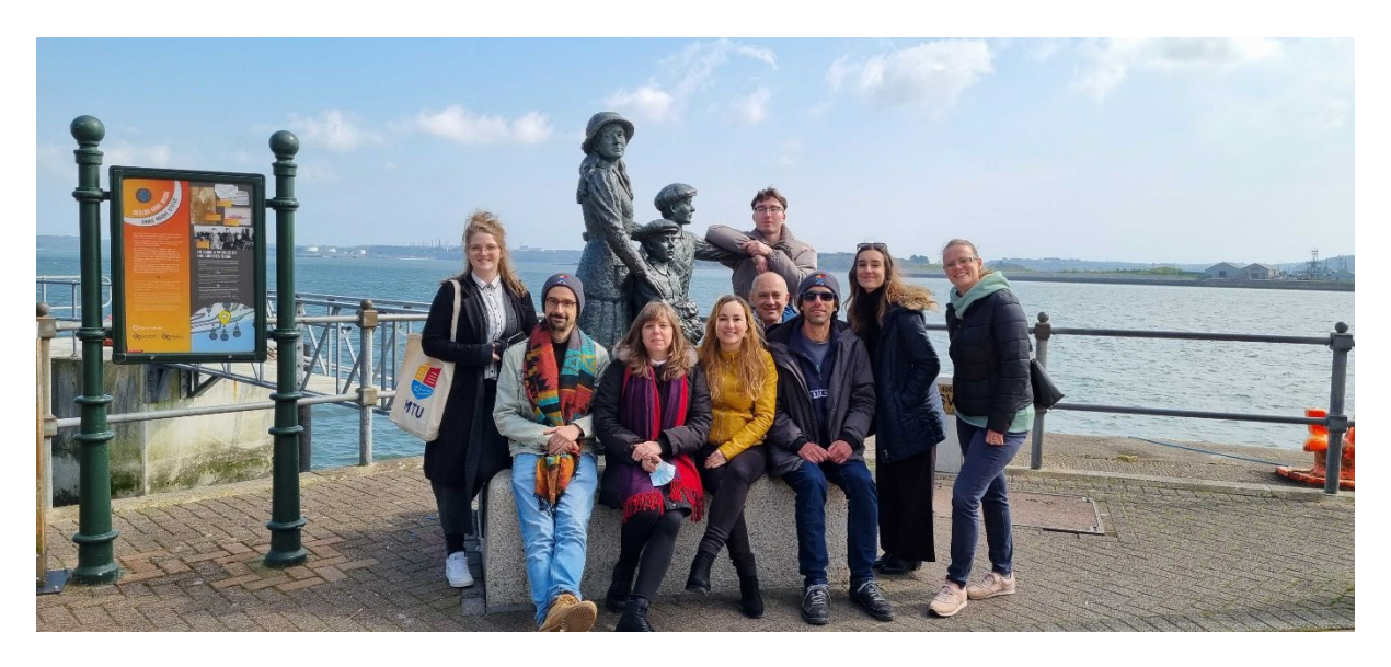
The participants on the Quay-side in Cobh

At the Cobh Heritage Centre the participants learned about the Irish emigrant experience via the centre's award-winning story-led exhibition.