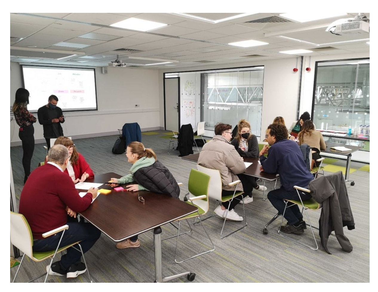
Participants engaged in the design thinking workshop